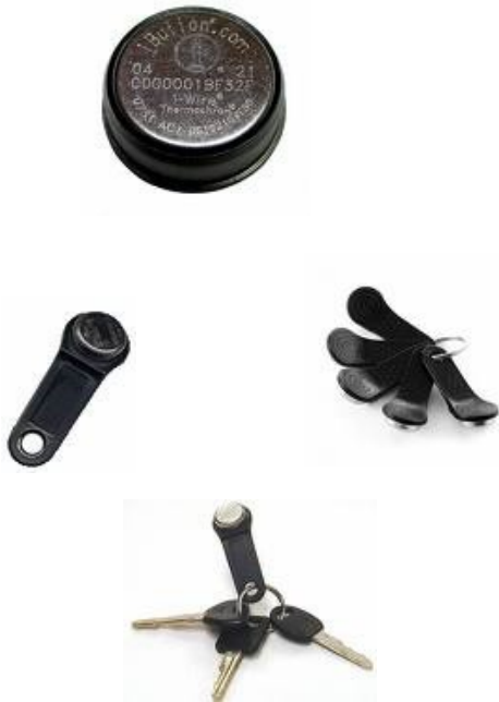
Figures 3: different types of iButtons available in the market

in Argentina and Brazil for parking meters; and in the United States as Blue Mailbox attachments that improve postal efficiency.