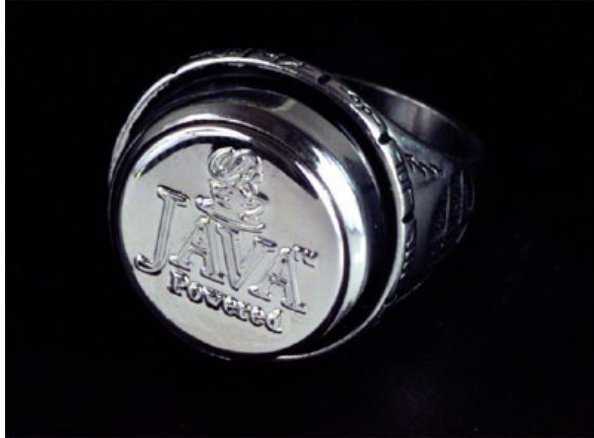
Fig 1: Prototype of a stainless steel java ring

Java Ring is snapped into a reader, called a Blue Dot receptor, to allow communication between a host system and the Java Ring.