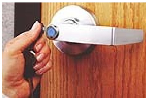
Figure 5: how java ring is used to open the door

Since java ring is programmed with the applets and the programming is done according to our application and this will be specific for the specific user. All information of the user is stored in the java ring.