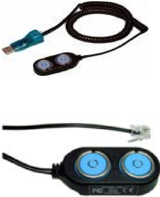
Figures 4: different types of blue dot receptor in the market