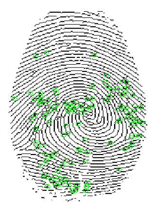
Fig.6 Minutiae Extraction and Zooming