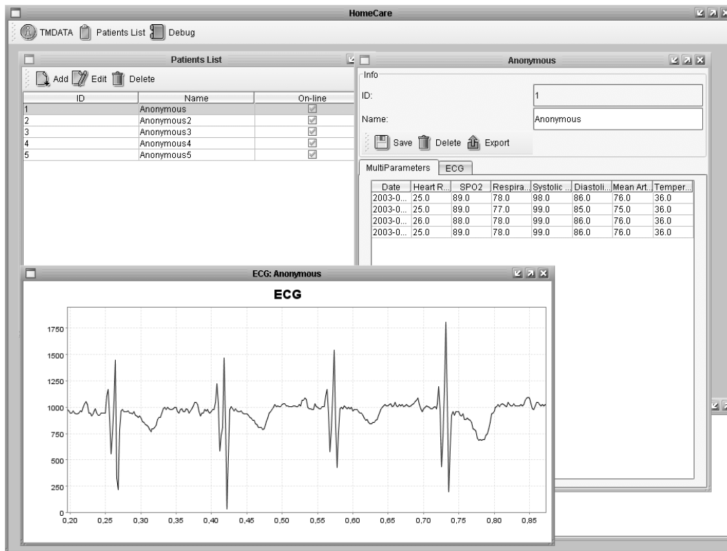
Fig. 4. Server application.

Home care represents a growing field in the health assistance [15]. It reduces costs and increases the quality of life of patients. As the modern life becomes more stressful and acute diseases appear, prolonged treatments become more necessary. The same occurs for the elderly or handicapped patients. Home care offers the possibility of treatment in the patient's house, with the assistance of the family. It reduces the need of transporting patients between house and hospital.