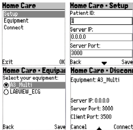
Fig. 2. Interface on mobile phone.

The system can interact with other applications through the XML exported files. Using standards represents an important step for integrating telemedicine systems.